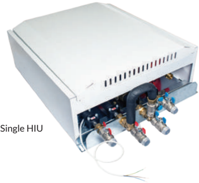
Indirect Single HIU