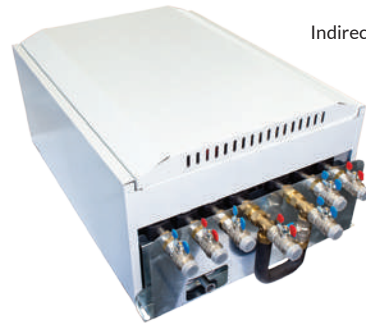
Indirect Twin HIU